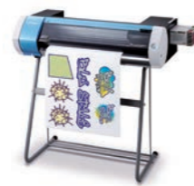
Optional Stand PNS-24